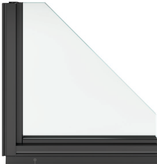
Bold modern frame

For full range of configurations and standard sizes refer to the standard size and range charts.